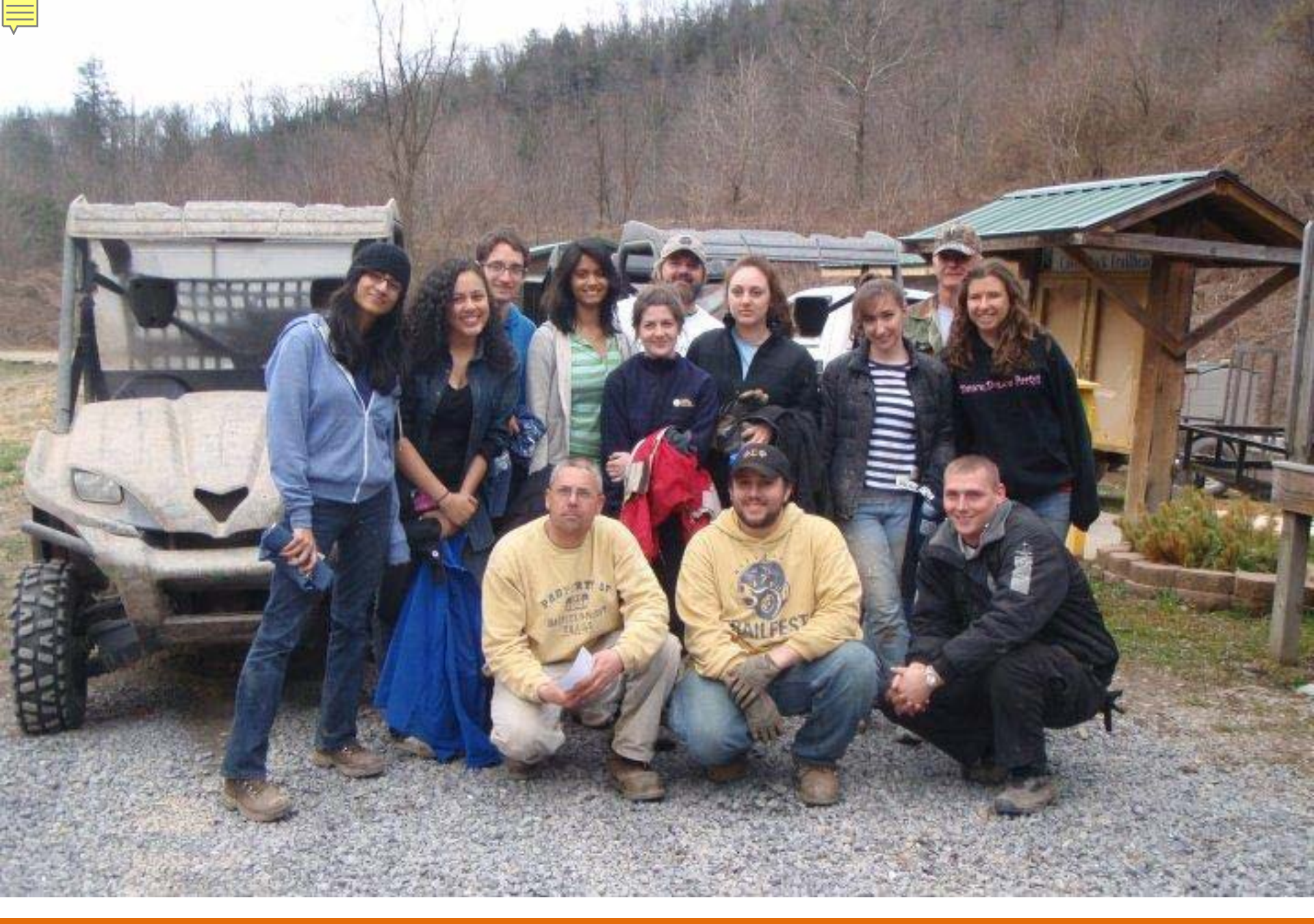
Partnerships with ATV groups