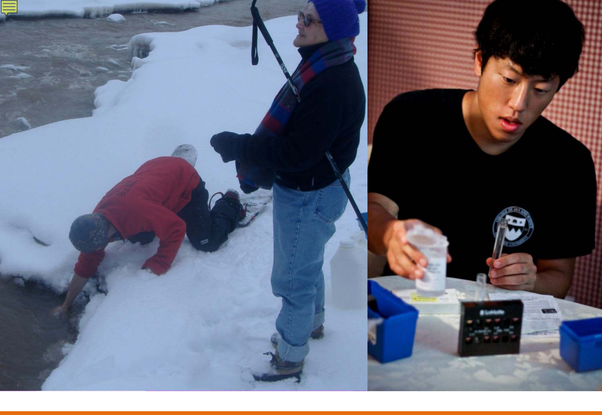
Water monitoring through individuals